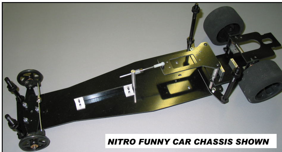
NITRO FUNNY CAR CHASSIS SHOWN