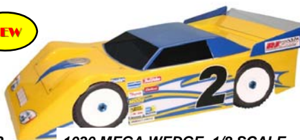
1030 MEGA WEDGE 1/8 SCALE