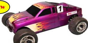
1029 STINGER 10 FOR ELEC/NITRO RUSTLER