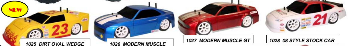
1025 DIRT OVAL WEDGE