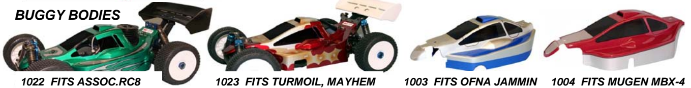
1022 FITS ASSOC.RC8