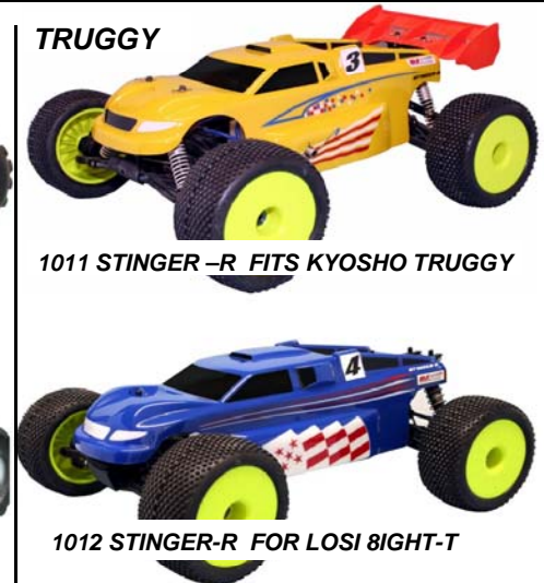
1011 STINGER -R FITS KYOSHO TRUGGY