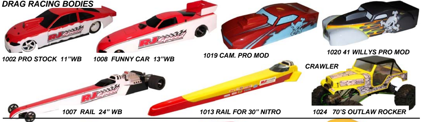
1002 PRO STOCK 11" WB