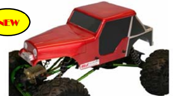
1031 MODIFIED 70'S CRAWLER