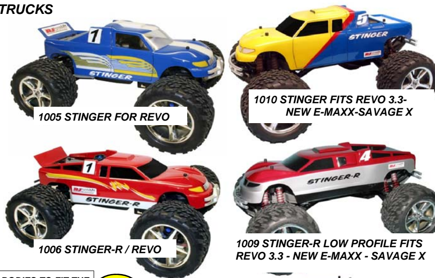
1005 STINGER FOR REVO