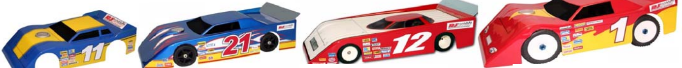
1014 FITS LOSI MINI SLIDER