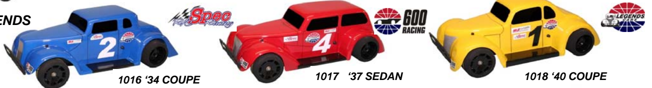
1016 '34 COUPE